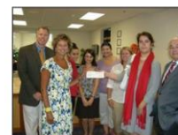
International Spanish Academies

Vision 2020: My Tomorrow , News from ISA Academy of Multilingual Immersion Studies, Cincinnati, Ohio