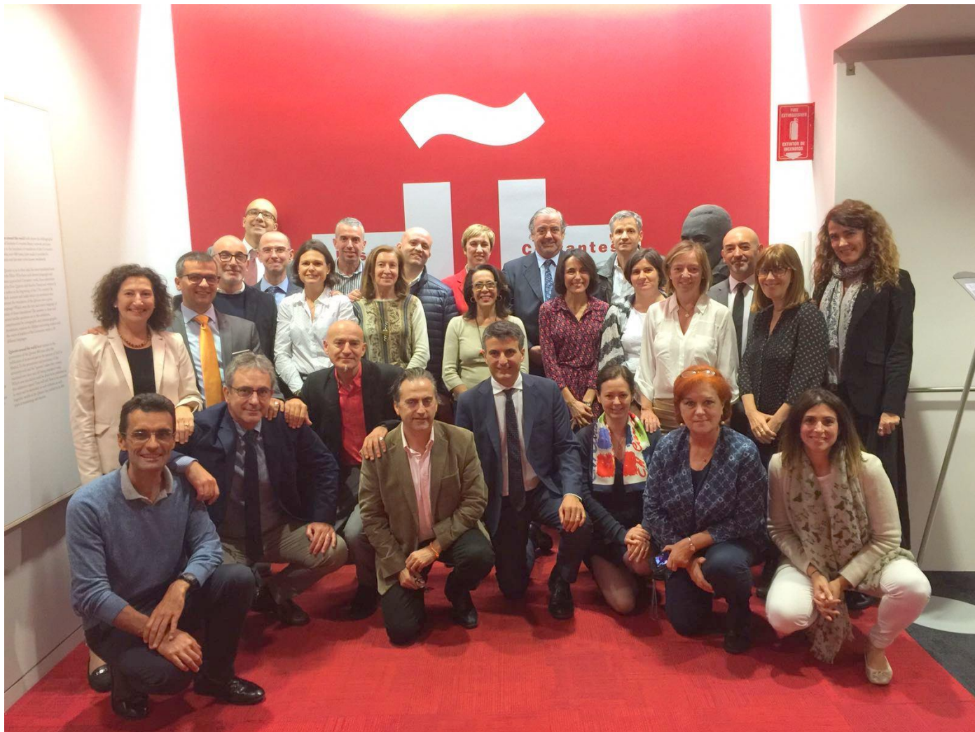
The Spanish Education Office team (Chicago, October 2016)

The Visiting Teachers from Spain : presentation video from the Spanish Education Office.